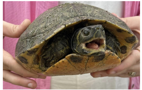
Ted the Turtle says “I’ve been training for this all year!”

Thank you to ALL who helped. We couldn’t have done it without you!